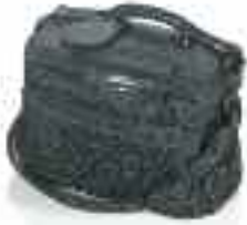
Evergo Portable Oxygen Concentrator