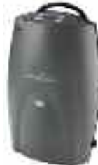
Eclipse POC