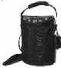
Invacare XPO2™ POC