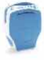
LifeChoice® Portable Oxygen Concentrator